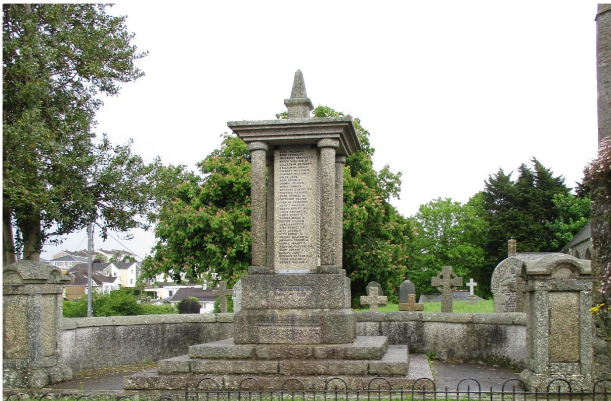
St. Stephen's Church War Memorial

Inscription on St. Stephens-by-Saltash WW1 War Memorial