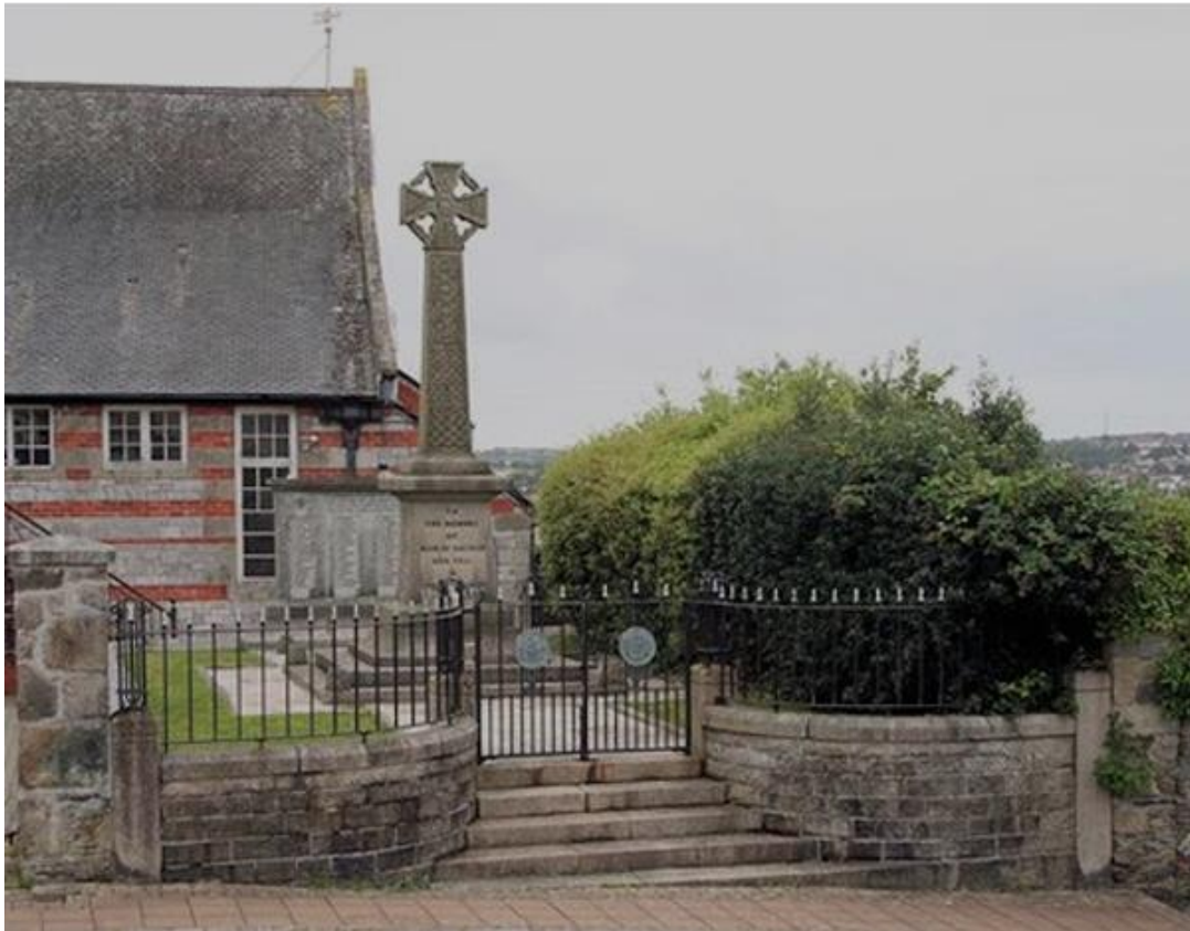
Borough of Saltash War Memorial