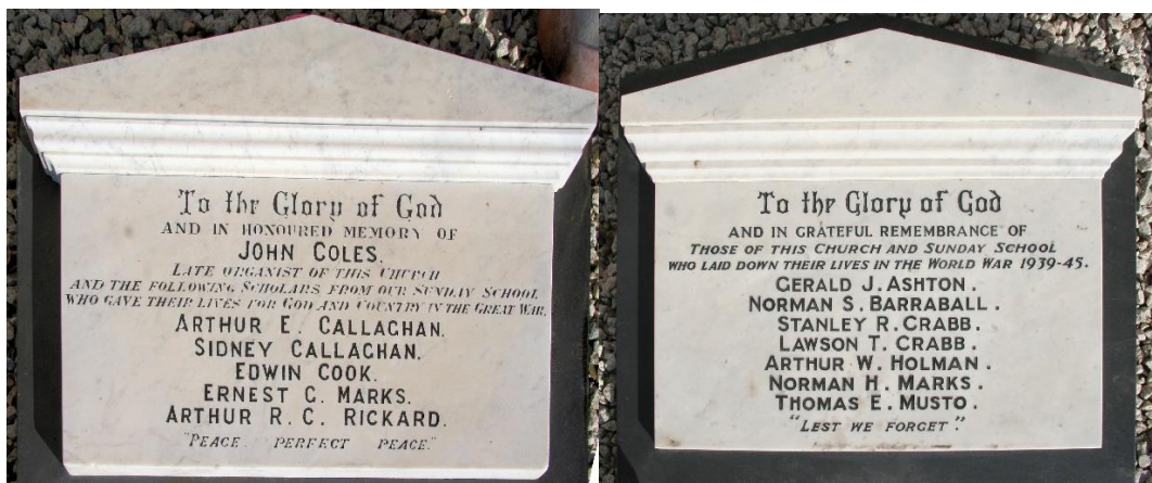
Saltash Burraton Methodist Chapel WW1 & WW2 memorials