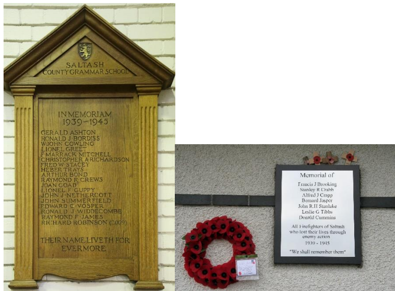
Saltash County Grammar School and Saltash Fireman's WW2 memorials